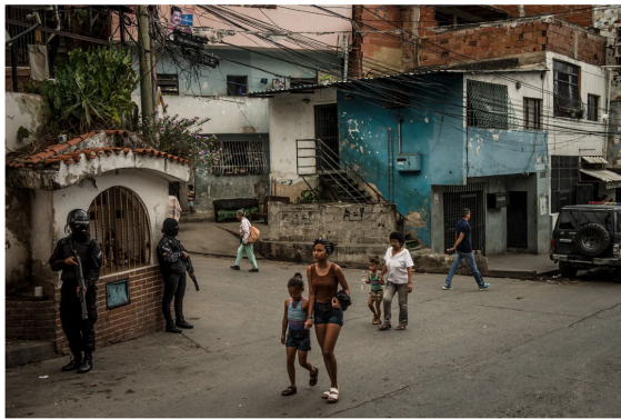
Petare, a slum in Caracas, Venezuela, where violent protests have erupted challenging the legitimacy of Nicolás Maduro's presidency.